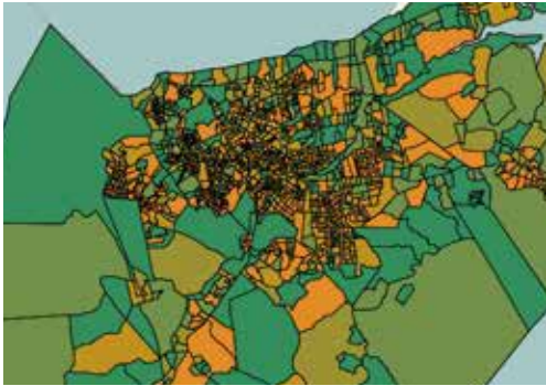
POPULATION THEMATIC MAPS

Geobis offers a set of appropriate alternatives in a few steps to understand issues associated with the geographical location of customers and relations of great importance that these saved with the demographic and socioeconomic.